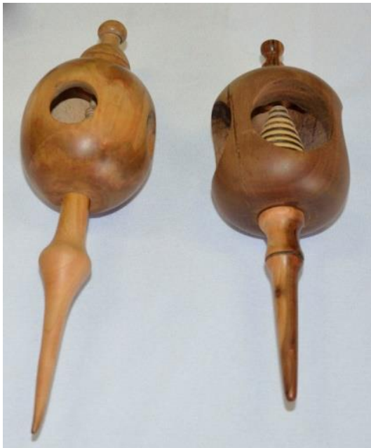
Binne-buite draaiwerk deur Kobus Mostert / Inside-outside turning by Kobus Mostert.