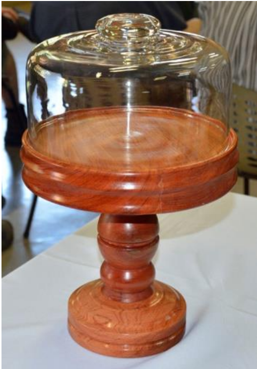
Koekstaander deur Ferdie Bingle. / Cake stand by Ferdie Bingle.