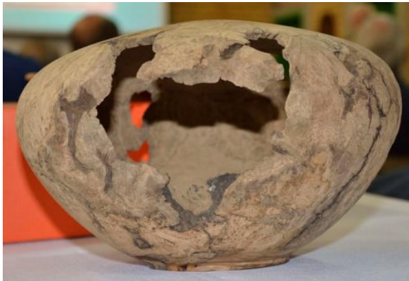
Onvoltooide bak uit 'n wortelknoets gedraai deur Alan Crawford. / Incomplete bowl from a root-burl by Alan Crawford.