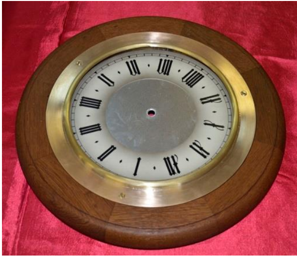
At Smit se horlosie gemaak uit 'n ou drukmeter. Die aluminiumplaat wat deel van die gesigsplaat vorm, is ook op 'n houtdraaibank gedraai. / At Smit's clock made from an old pressure gauge. The aluminium plate which is part of the face, was also turned on a wood lathe.